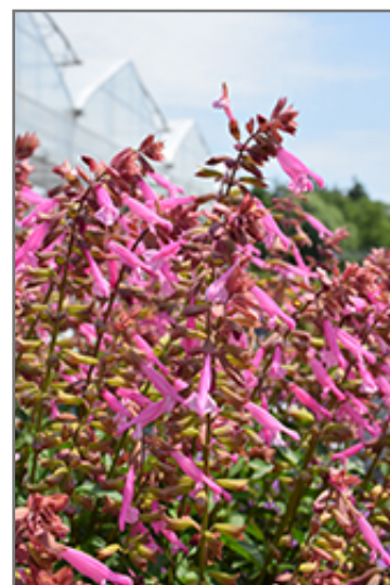
Skyscraper Pink Salvia flowers

Skyscraper Pink Salvia is an herbaceous annual with an upright spreading habit of growth. Its relatively fine texture sets it apart from other garden plants with less refined foliage.