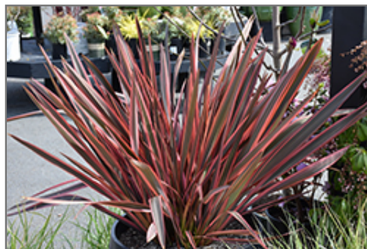
Rainbow Chief New Zealand Flax