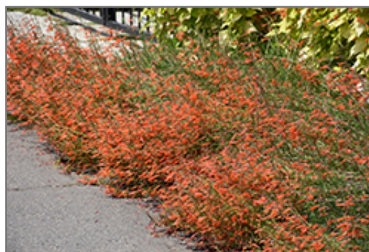
Luminous Pineleaf Beard Tongue in bloom