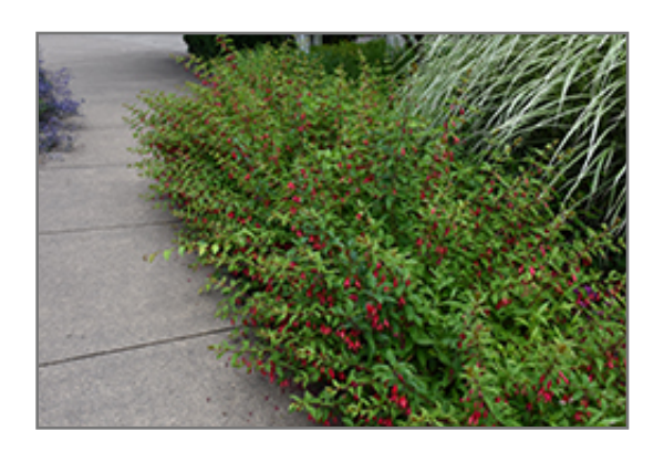
Hardy Fuchsia in bloom