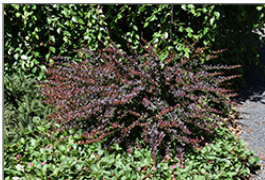
Lava Nugget Barberry