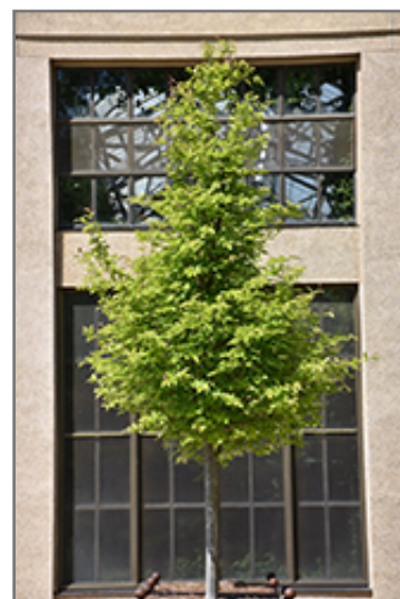
Persian Parrotia