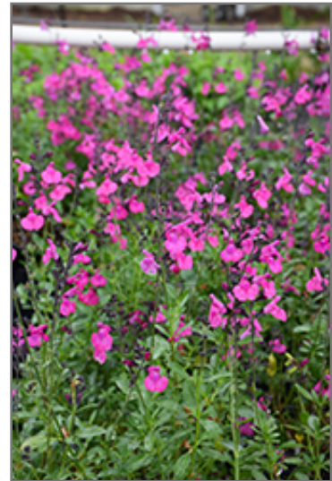
Raspberry Autumn Sage flowers

Raspberry Autumn Sage is recommended for the following landscape applications;