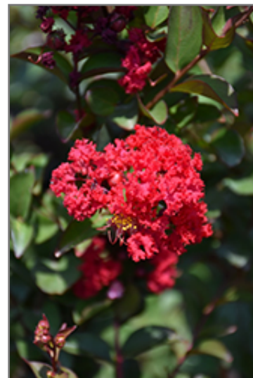
Princess Zoey Crapemyrtle flowers