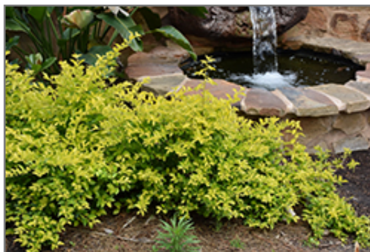
Cuban Gold Duranta