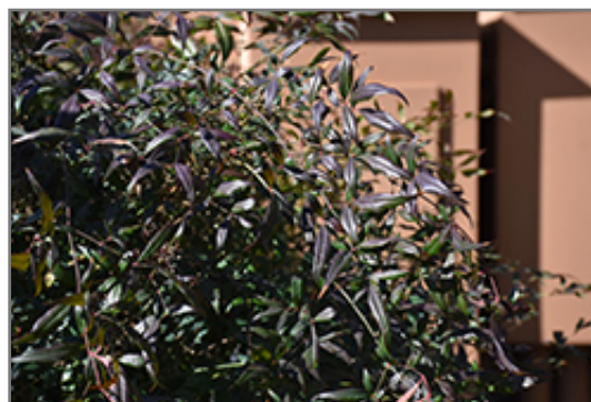
Plum Passion Nandina foliage