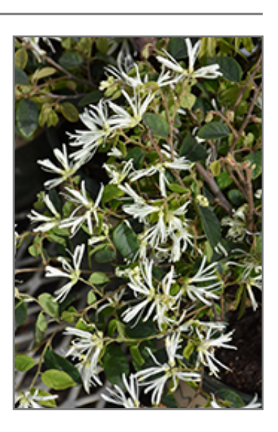
Snow Panda Fringeflower flowers

Snow Panda Fringeflower will grow to be about 10 feet tall at maturity, with a spread of 8 feet. It has a low canopy, and is suitable for planting under power lines. It grows at a fast rate, and under ideal conditions can be expected to live for 40 years or more.