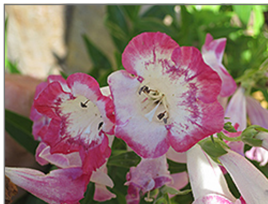
Bev Jensen Beard Tongue flowers