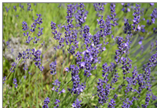
Provence Blue Lavender flowers