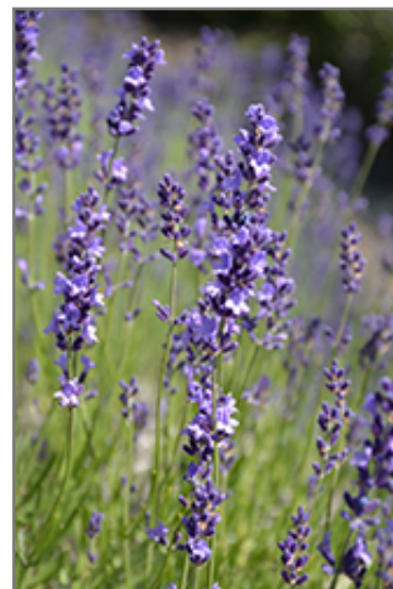
Provence Blue Lavender flowers

This is a relatively low maintenance shrub, and can be pruned at anytime. It is a good choice for attracting bees and butterflies to your yard, but is not particularly attractive to deer who tend to leave it alone in favor of tastier treats. It has no significant negative characteristics.