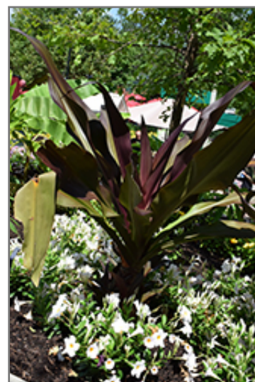
Queen Emma Giant Spider Lily foliage