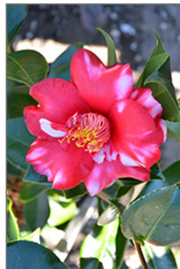
Midnight Variegated Camellia flowers