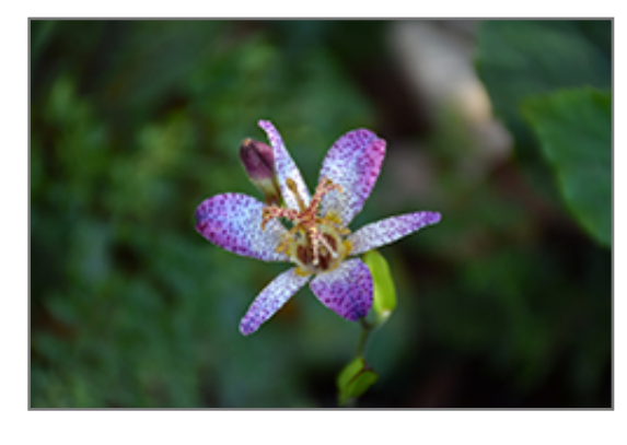
Amethyst Toad Lily flowers