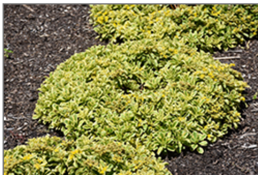
Cutting Edge Stonecrop

Cutting Edge Stonecrop will grow to be only 6 inches tall at maturity, with a spread of 16 inches. When grown in masses or used as a bedding plant, individual plants should be spaced approximately 12 inches apart. Its foliage tends to remain low and dense right to the ground. It grows at a fast rate, and under ideal conditions can be expected to live for approximately 15 years. As an herbaceous perennial, this plant will usually die back to the crown each winter, and will regrow from the base each spring. Be careful not to disturb the crown in late winter when it may not be readily seen!