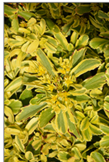
Cutting Edge Stonecrop flowers

Cutting Edge Stonecrop is recommended for the following landscape applications;