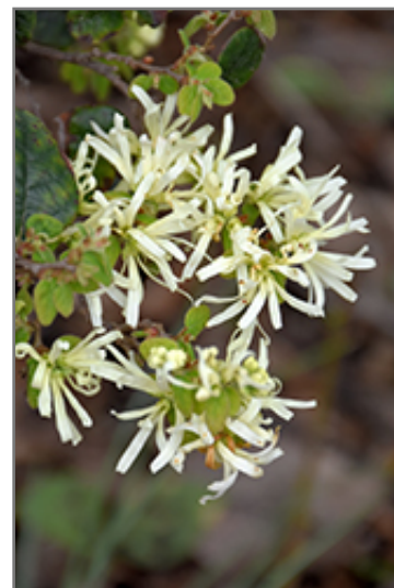
Snow Muffin Chinese Fringeflower flowers