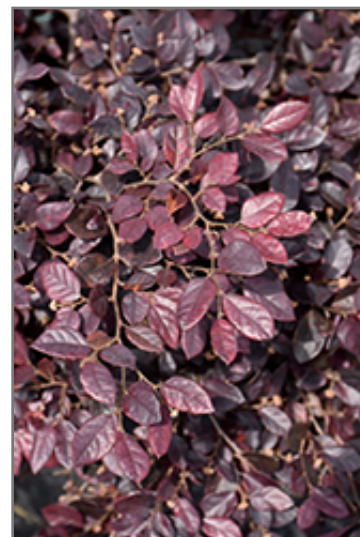
Plum Gorgeous Fringeflower foliage