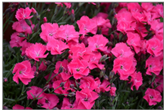
Vivid Bright Light Pinks flowers