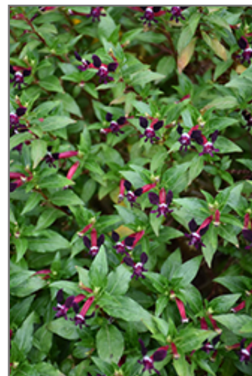
Ballistic Cuphea flowers