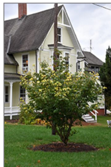
Champion's Gold Chinese Dogwood