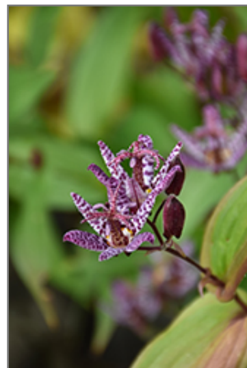
Toad Lily flowers