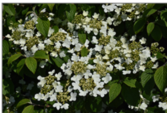
Wabi Sabi Doublefile Viburnum flowers