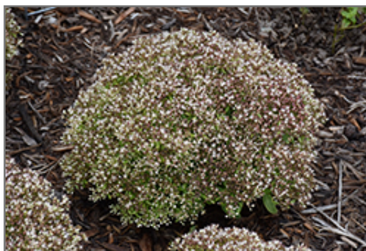
Rock 'N Round Bundle Of Joy Stonecrop in bloom