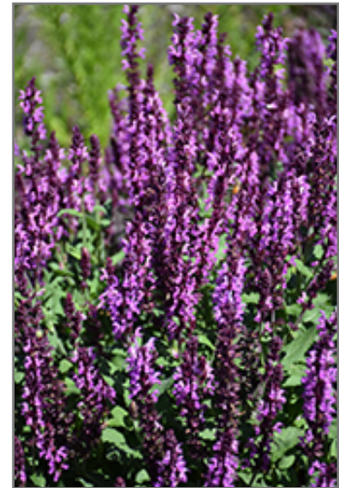
Pink Profusion Meadow Sage flowers