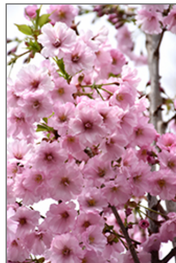
First Blush Flowering Cherry flowers