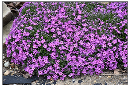
Rocky Road Pink Phlox in bloom