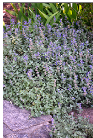
Early Bird Catmint in bloom