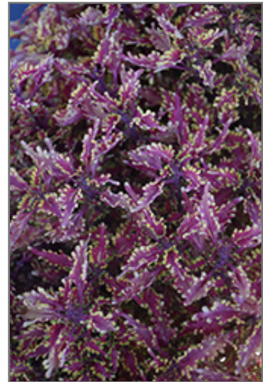
Terra Nova Scarlet Ibis Coleus foliage