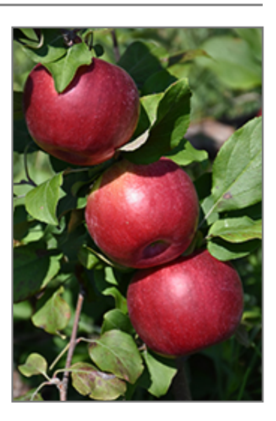
Hazen Apple fruit

Aside from its primary use as an edible, Hazen Apple is sutiable for the following landscape applications;