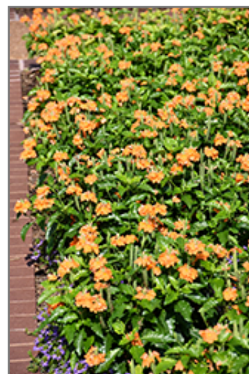
Orange Marmalade Firecracker Plant in bloom