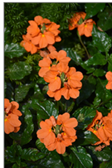
Orange Marmalade Firecracker Plant flowers

Orange Marmalade Firecracker Plant is a fine choice for the garden, but it is also a good selection for planting in outdoor pots and containers. It can be used either as 'filler' or as a 'thriller' in the 'spiller-thriller-filler' container combination, depending on the height and form of the other plants used in the container planting. Note that when growing plants in outdoor containers and baskets, they may require more frequent waterings than they would in the yard or garden.