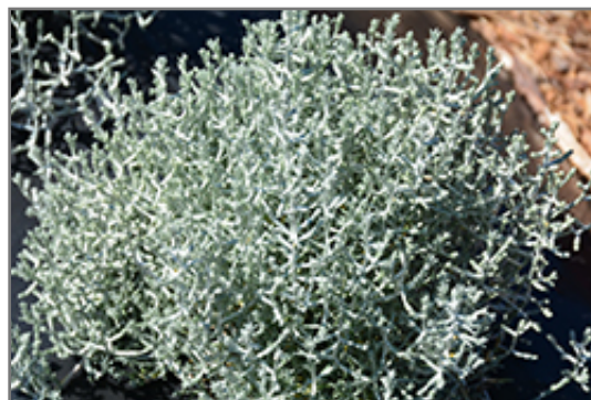
Bed Head Cushion Bush