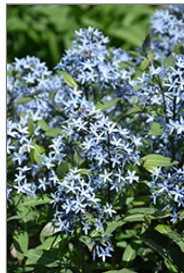
Storm Cloud Bluestar flowers