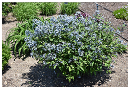
Storm Cloud Bluestar in bloom