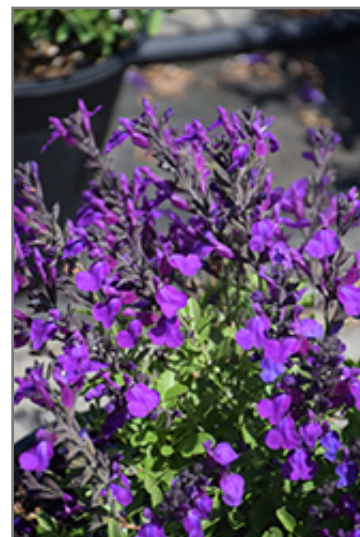
Mirage Deep Purple Autumn Sage flowers

Mirage Deep Purple Autumn Sage is recommended for the following landscape applications;