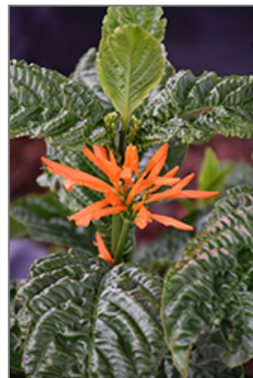
Orange Flame Justicia flowers