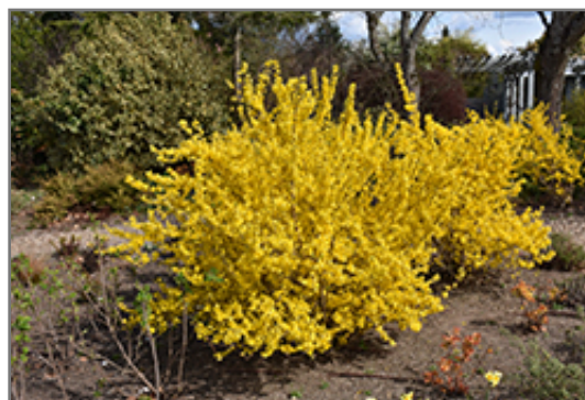
Magical Gold Forsythia in bloom