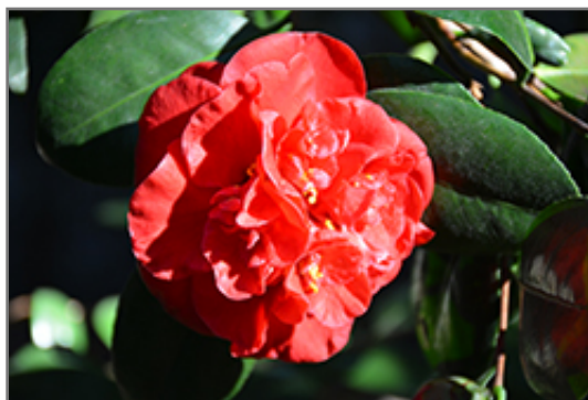
Dixie Knight Camellia flowers