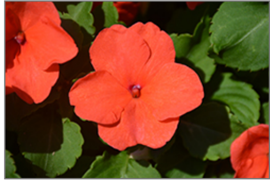
Accent Premium Salmon Impatiens flowers