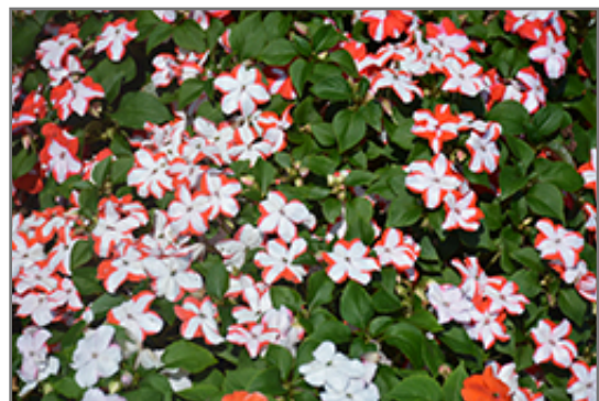
Accent Premium Orange Star Impatiens flowers