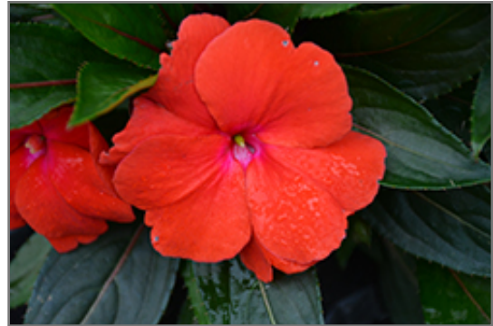
Magnum Red Flame New Guinea Impatiens flowers