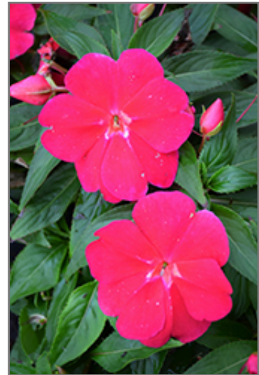
Divine Lipstick New Guinea Impatiens flowers