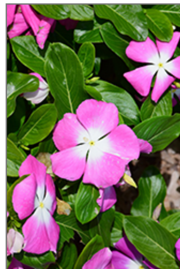
Mega Bloom Pink Halo Vinca flowers

Mega Bloom Pink Halo Vinca is recommended for the following landscape applications;