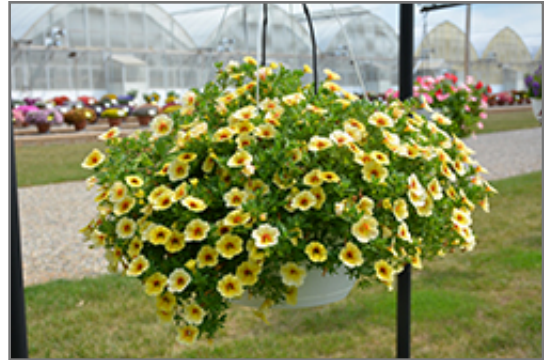
MiniFamous Neo Yellow Red Vein Calibrachoa in bloom

MiniFamous Neo Yellow Red Vein Calibrachoa is a fine choice for the garden, but it is also a good selection for planting in outdoor containers and hanging baskets. Because of its trailing habit of growth, it is ideally suited for use as a 'spiller' in the 'spiller-thriller-filler' container combination; plant it near the edges where it can spill gracefully over the pot. Note that when growing plants in outdoor containers and baskets, they may require more frequent waterings than they would in the yard or garden.