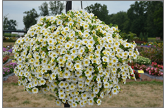
MiniFamous Neo White + Yellow Eye Calibrachoa in bloom

MiniFamous Neo White + Yellow Eye Calibrachoa is a fine choice for the garden, but it is also a good selection for planting in outdoor containers and hanging baskets. Because of its trailing habit of growth, it is ideally suited for use as a 'spiller' in the 'spiller-thriller-filler' container combination; plant it near the edges where it can spill gracefully over the pot. Note that when growing plants in outdoor containers and baskets, they may require more frequent waterings than they would in the yard or garden.