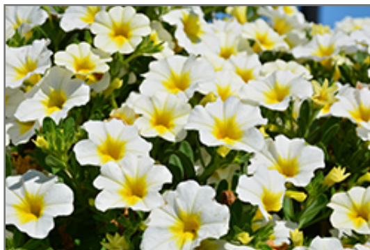
MiniFamous Neo White + Yellow Eye Calibrachoa flowers

This plant will require occasional maintenance and upkeep. Trim off the flower heads after they fade and die to encourage more blooms late into the season. It is a good choice for attracting bees and hummingbirds to your yard, but is not particularly attractive to deer who tend to leave it alone in favor of tastier treats. It has no significant negative characteristics.