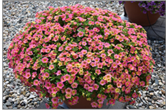
Chameleon Sunshine Berry Calibrachoa in bloom

Chameleon Sunshine Berry Calibrachoa is a fine choice for the garden, but it is also a good selection for planting in outdoor containers and hanging baskets. Because of its trailing habit of growth, it is ideally suited for use as a 'spiller' in the 'spiller-thriller-filler' container combination; plant it near the edges where it can spill gracefully over the pot. Note that when growing plants in outdoor containers and baskets, they may require more frequent waterings than they would in the yard or garden.