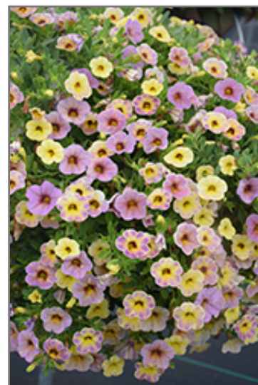
Chameleon Blueberry Scone Calibrachoa flowers