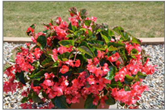
Megawatt Rose Green Leaf Begonia in bloom

Megawatt Rose Green Leaf Begonia is a fine choice for the garden, but it is also a good selection for planting in outdoor containers and hanging baskets. With its upright habit of growth, it is best suited for use as a 'thriller' in the 'spiller-thriller-filler' container combination; plant it near the center of the pot, surrounded by smaller plants and those that spill over the edges. It is even sizeable enough that it can be grown alone in a suitable container. Note that when growing plants in outdoor containers and baskets, they may require more frequent waterings than they would in the yard or garden.