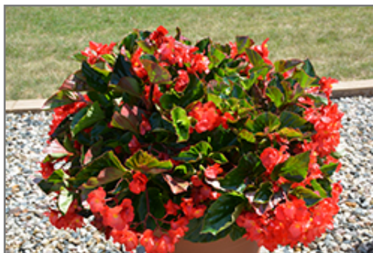
Megawatt Red Green Leaf Begonia in bloom

Megawatt Red Green Leaf Begonia is a fine choice for the garden, but it is also a good selection for planting in outdoor containers and hanging baskets. With its upright habit of growth, it is best suited for use as a 'thriller' in the 'spiller-thriller-filler' container combination; plant it near the center of the pot, surrounded by smaller plants and those that spill over the edges. It is even sizeable enough that it can be grown alone in a suitable container. Note that when growing plants in outdoor containers and baskets, they may require more frequent waterings than they would in the yard or garden.