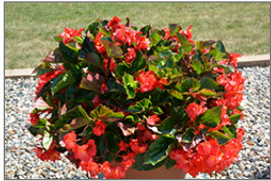
Megawatt Red Green Leaf Begonia in bloom

Megawatt Red Green Leaf Begonia is a fine choice for the garden, but it is also a good selection for planting in outdoor containers and hanging baskets. With its upright habit of growth, it is best suited for use as a 'thriller' in the 'spiller-thriller-filler' container combination; plant it near the center of the pot, surrounded by smaller plants and those that spill over the edges. It is even sizeable enough that it can be grown alone in a suitable container. Note that when growing plants in outdoor containers and baskets, they may require more frequent waterings than they would in the yard or garden.