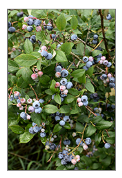
Rubel Blueberry fruit