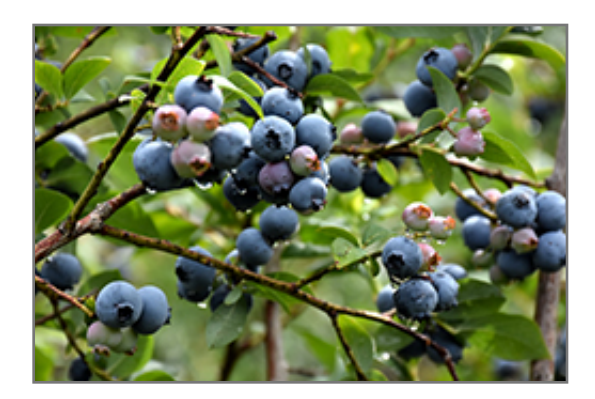
Rubel Blueberry fruit

Rubel Blueberry features dainty clusters of white bell-shaped flowers with shell pink overtones hanging below the branches in mid spring. It has green deciduous foliage. The glossy oval leaves turn red and orange in fall. It features an abundance of magnificent blue berries in mid summer. The smooth brick red bark and yellow branches add an interesting dimension to the landscape.